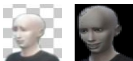
nature man / nature guy

main protagonist esteemed pervert expert in self – loathing self-destructive bent convinced he is the good guy dysfunctional alcoholic potential incel