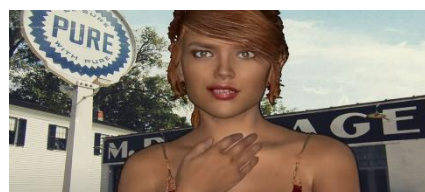
unspecified woman / 'babe'

main protagonist esteemed pervert expert in self – loathing self-destructive bent convinced he is the good guy dysfunctional alcoholic potential incel