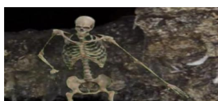
funky dancing fatberg skeleton

lives in the london fatberg dances to copyright- free jazz music very cryptic extremely personable and welcoming to his fatberg a wise man holds a real grudge against lawyers