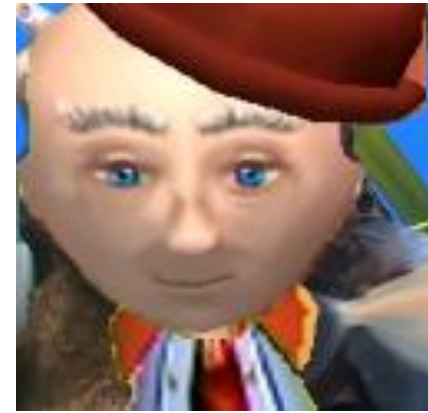
owner of the fosters lager underwater circus

dwells underwater very wise often speaks in riddles breathes heavily appears almost as an apparition always sharply dressed origin story unknown